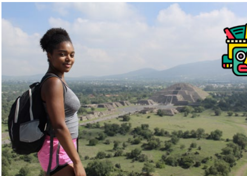
*SummerMX students, 2019*

Located in one of the city's best districts, it opened its doors in 2003. On 25 hectares, you will find excellent facilities with classrooms equipped with state-of-the-art technology as well as cafeterias, gymnasium, fields, and courts to practice your favorite sport. Furthermore, the city of Puebla is located 2 hours away from Mexico City, which makes this campus very attractive for students who wish to travel without having to move great distances.